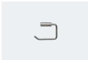
Single Toilet Roll Holder TSL.45