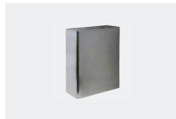
25L Waste Receptacle TSL.279