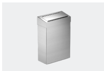
Wall-Mounted 10L Sanitary Bin TSL.908