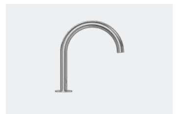
Radius Auspex Tap Swan Neck TSL.892