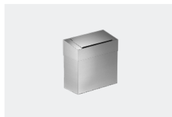
Wall-Mounted 7L Sanitary Bin TSL.909