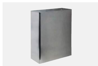
25L Waste Receptacle TSL.279