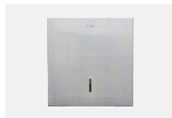
Lockable Toilet Roll Holder TSL.842