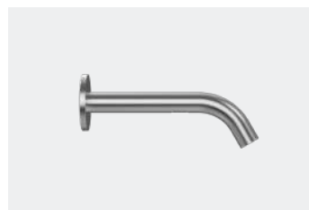
Radius Auspex Tap 150mm TSL.895