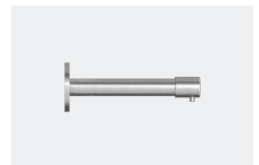
Wall Mounted Manual Soap Dispenser TSL.470