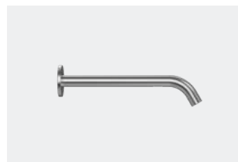
Radius Auspex Tap 220mm TSL.894