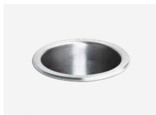
Circular Waste Chute TSL.R15