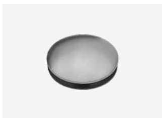
Universal Click Clack Waste Fitting TSL.673