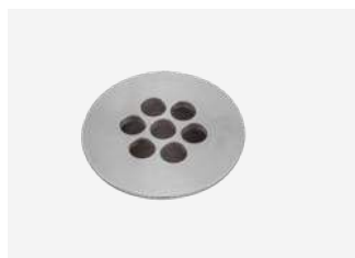
Waste Grate TSL.680